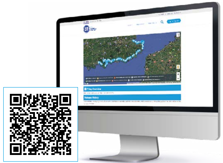
▲ Beachbuoy, our near real-time storm overflow activity tool

During heavy or prolonged rainfall, the network would become overwhelmed in several areas – or catchments as we call them – with nowhere for the wastewater to go, but back up into people's homes and onto roads. This would cause major flooding and pollution for the community.